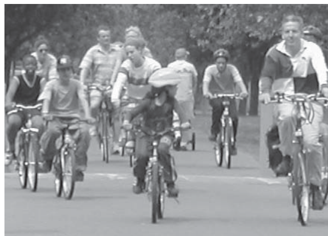
Having a wheely good trip – bikers who took part in BARA’s Family Cycle Ride on Sunday 1 June.

Ages ranged from three years old to something over 50. Distance covered 15.3 miles, average speed three miles per hour, and a great time was had by all.