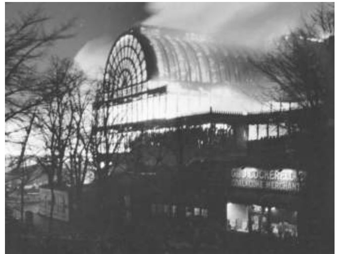
The Crystal Palace fire of 1936 – visible from Leybourne Road

We had trolley-buses after the trams, a great innovation. They put railings up to stop people running into the road, but all the railings did was stop the cows –